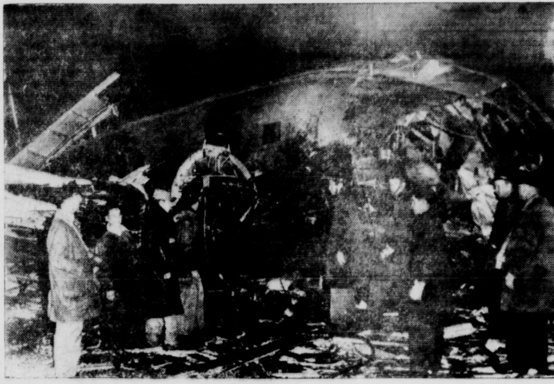
Crowds view the wreckage of an Air Force C-47 plane which crashed into two unoccupied barracks at Chanute Field, Ill., killing at least three of the 21 persons aboard. Diverted from its course to Scott Field, the craft "undershot" in an attempted landing.—(NEA Telephoto).