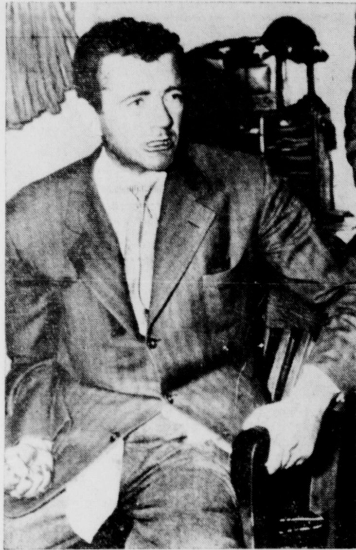
Actor Robert Walker, shown with shirt-tails hanging and bruised fist clenched, sits in a west Hollywood Police Station, following his arrest on a drunk charge. Walker was riding in a