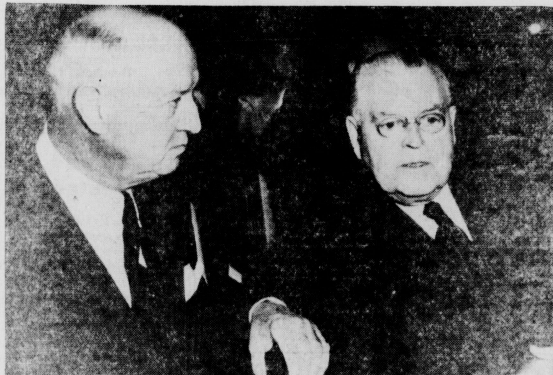
Former Postmaster General James A. Farley, left, holds a derisive discussion with U. S. delegate to the United Nations, Warren R. Austin. Farley attended a meeting of the political committee in Paris.