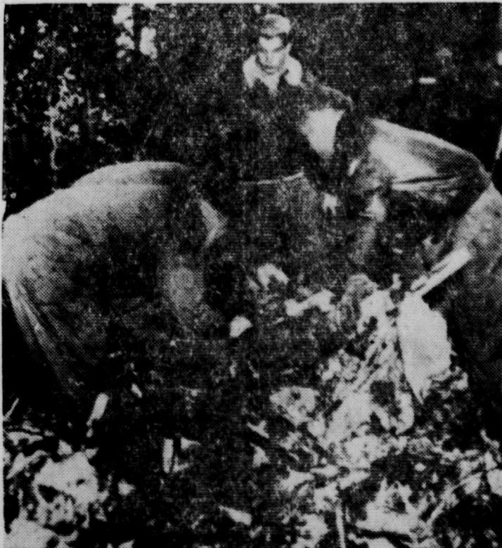
Rescue crews search the debris of a wrecked four-engine C-54 plane which crashed near Frankfurt, Germany, while returning from Berlin on an airlift flight. Four crew members were killed.