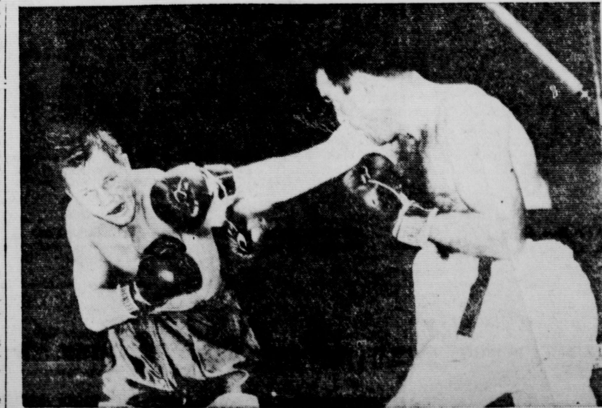
A right cross by Marcel Cerdan, right, stands Tony Zale's hair on end in the 10th round of their middleweight title fight in Jersey City. Cerdan was credited with a knockout in the 12th round when Zale failed to come out at the bell.