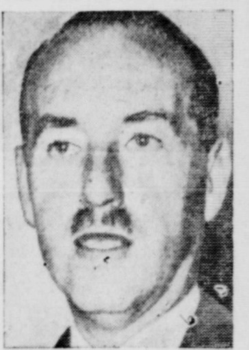
Paul Van Zeeland, above, may become the next UN mediator in Palestine. He would succeed the late Count Folke Bernadotte, assassinated in Jerusalem. Van Zeeland, a Belgian, was the alternate choice when the Swedish count was first appointed.

Maybe there's no point to it. But neither is there a point to the yo-yo, except to soothe one's jangled nerves. The Pixies believe that whether or not you win at politics you can relax and enjoy it.