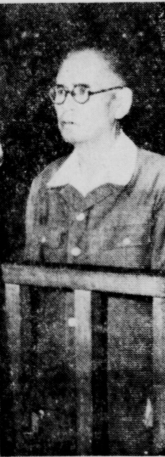
General Yasutsuga Okamura, the Commander in Chief of the China Theater during the past war, pleaded innocent to charges of the War Crimes Tribunal in Tokyo. He was charged with letting his men harm prisoners of war. He said that during his command he knew of not one case of atrocity committed by his troops.