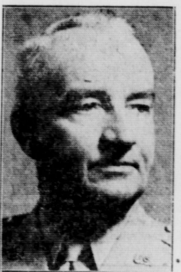
Lieut. Gen. Eichelberger

In the Mexican border warfare against Pancho Villa in 1916, First