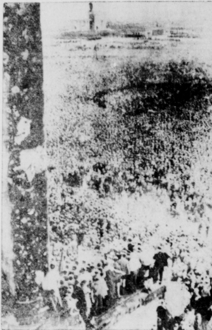
An estimated crowd of 300,000 jammed the square in front of Berlin's ruined Reichstag building in Berlin, to demonstrate against Communist activities. This photo, made from atop the Reichstag building, shows the huge crowd with Russian war memorial building in the background. The picture was made just before Russian soldiers with Tommy guns fired into the crowd. The Reichstag building is on the British-Russian sector border.

quested us to remind all former residents of the meeting.