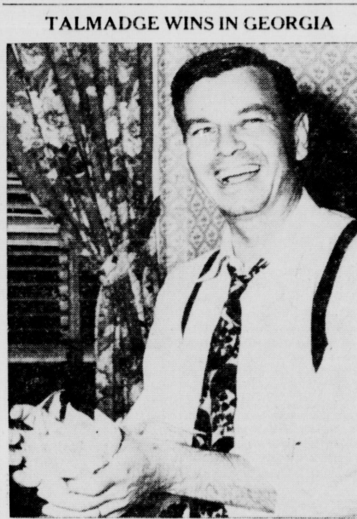
Herman Talmadge smiles broadly as he tears up the last returns of the Democratic primary election for governor of Georgia. Talmadge won over his opponent, acting Governor Melvin E. Thompson.