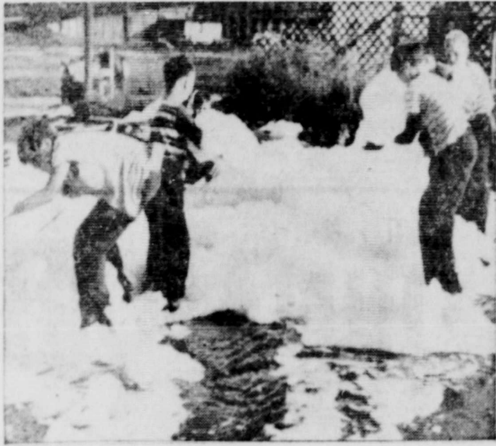
When fire swept the plant of the Lehigh Chemical Products Company, in Trainer, Pa., three 50,000-gallon tanks of liquid soap burst open. Firemen, playing streams of water on the tanks, created mountains of suds which flowed outside. The $60,000 blaze resulted in a new sport for boys around Trainer—suds fights.