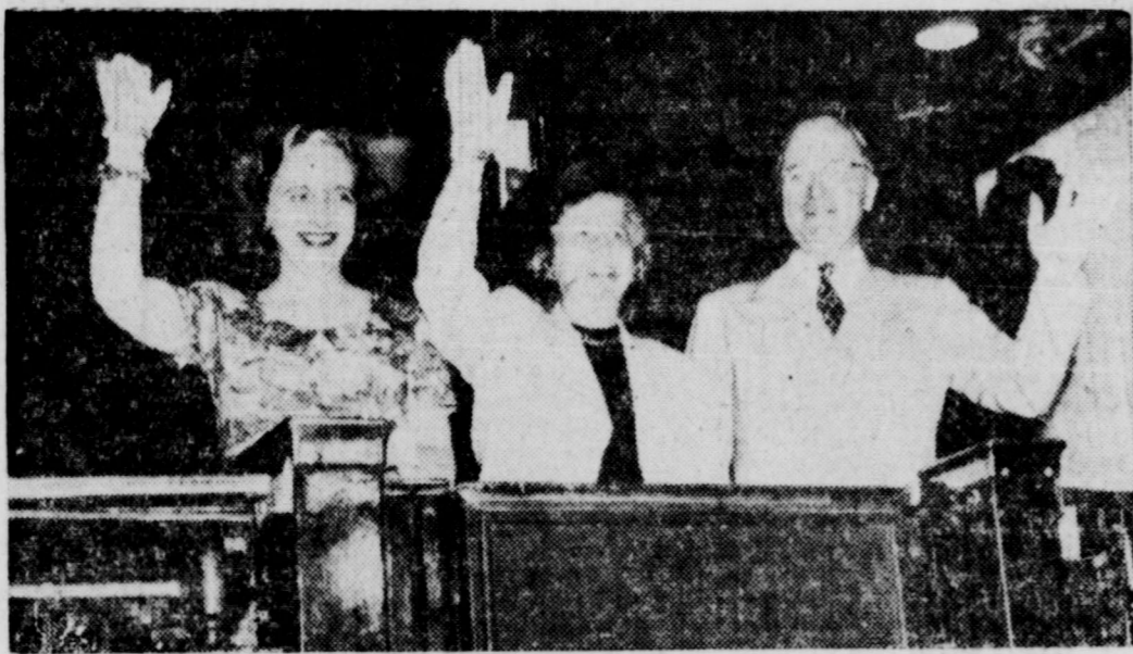
President Truman waves from rear platform of the Presidential train as he leaves the Capitol for the Democratic Convention in Philadelphia. Mr. Truman is accompanied by Mrs. Truman and Margaret.