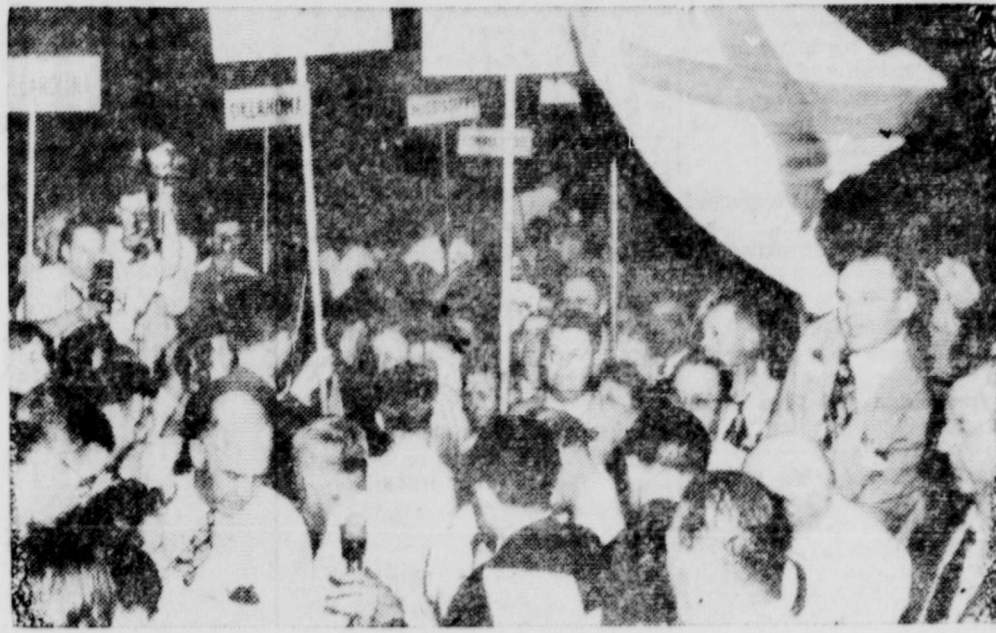
Waving the Confederate flag, 13 bolting Alabama delegates and all of Mississippi's 22 delegates walk out of the National Democratic Convention in the gathering's most dramatic moment thus far.