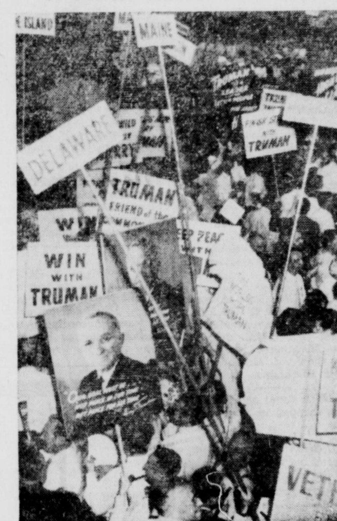
Convention Hall in Philadelphia was a deafening bedum when this photo was made at the height of the demonstration for President Truman and which preceded his arrival. Aisles were choked with markers.