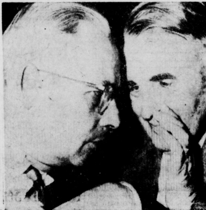
Whether to walk out or not might well have been the subject under discussion in this close huddle on the convention floor. Mississippi Governor Fielding L. Wright is at left; former Governor Hugh White at the right.