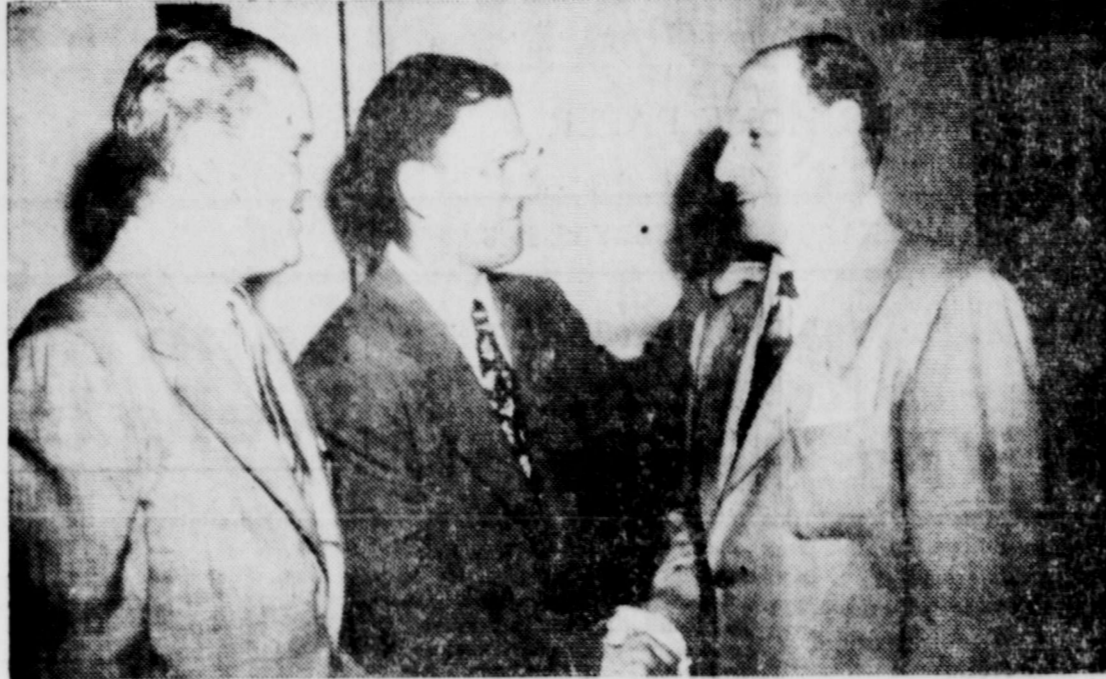
President Horace Stoneham, left, of New York Giants, watches Mel Ott, center, his resigned manager, and Leo Durocher, his new one, shake hands after press conference in New York City. Durocher left the Brooklyn Dodgers to take the managers spot with the Giants. The Durocher, Shotton, Ott switch was the baseball season's most startling shakeup.