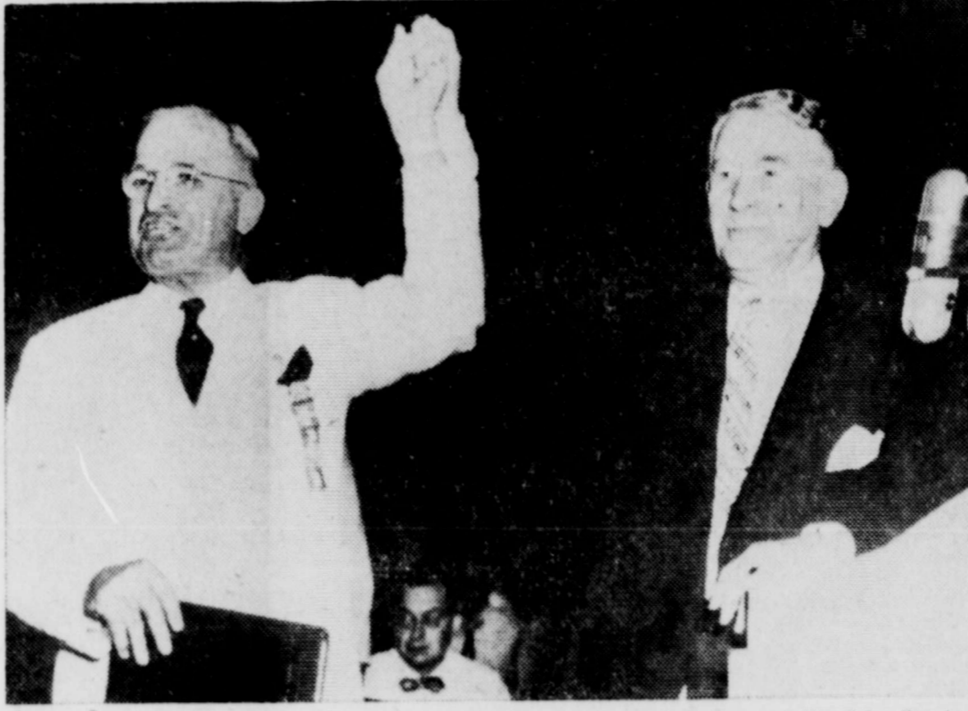
Hand-in-hand, the Democratic standard bearers for 1948 acknowledge the cheers of the delegates to the Democratic National Convention. Harry S. Truman of Missouri, and Senator Alben W. Barkley of Kentucky will carry the fight to the peoples of the U. S.