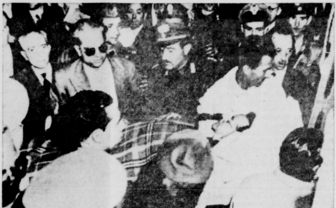
Followers and bystanders help as Palmiro Togliatti, Italy's Communist leader, is lifted into an ambulance in Rome, after being shot four times by a youthful assassin.