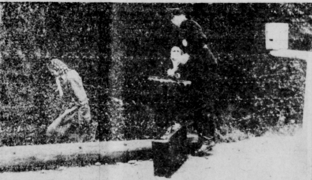
Two German girls who have succeeded in crossing illegally from the Russian zone in Berlin to the British zone, are given a helping hand by a German policeman, who's getting their baggage through the barbed wire beside the road at a British check.