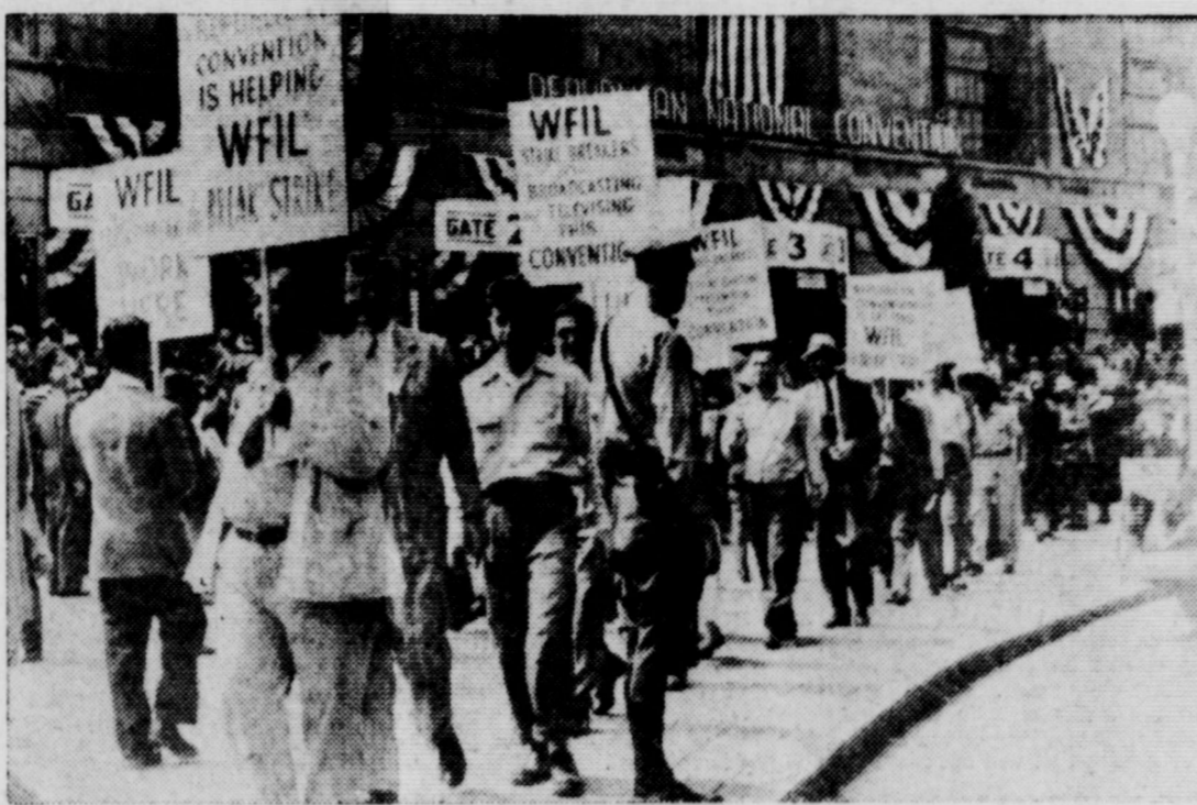
As the GOP convention was being called to order in Philadelphia, the American Communications Association, CIO, set up these picket lines in front of Convention Hall. Action followed the arrangements committee's refusal to deny broadcasting and television privileges to radio station WFIL, against whom the union is striking.