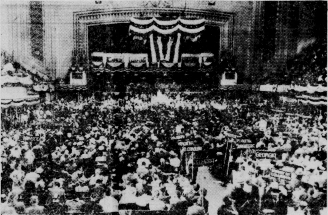
This is a general view of brightly-lighted and decorated Convention Hall in Philadelphia during the first morning's session of the Republican National Convention. Speaker's platform is in the rear center; delegates occupy most of the visible floor space and alternates are in the immediate foreground.