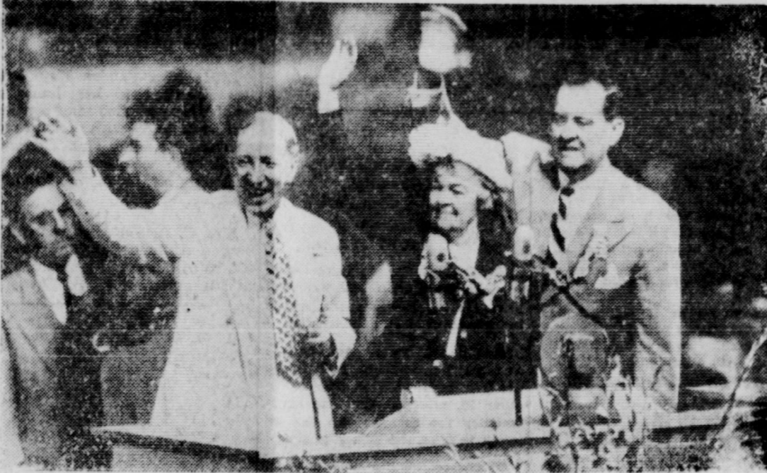
On the rostrum at convention hall as the Republican National Convention officially opened in Philadelphia are, left to right: Carroll Reece, chairman of the Republican National Committee; Representative Edith Nourse Rogers; and Walter S. Hallanan, chairman of the Committee on Convention Arrangements, who called the convention to order.