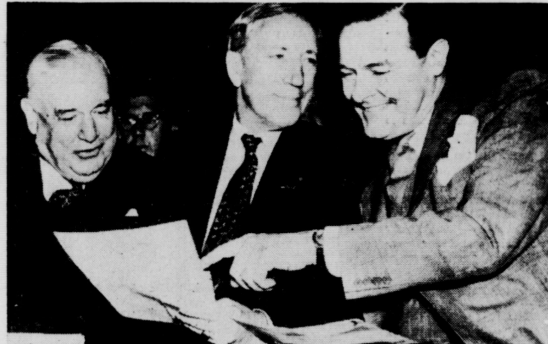
A preliminary huddle is held before the opening of the first session of the Republican National Committee's Resolution Committee by former Governor Walter E. Edge of New Jersey left, member of the resolutions committee; B. Carroll Reece, center, Chairman of Republican National Committee, and Senator Henry Cabot Lodge, Jr., of Massachusetts, member of resolutions committee.