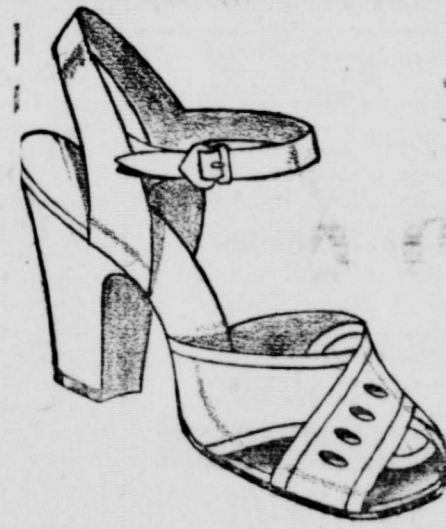
Beauty in Bemberg

DRESSES ... at Big Reductions About 200 Dresses to Choose From Were $10.95 to $16.95 Now $5.00 and $7.95