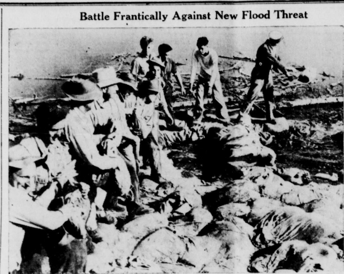
As authorities warned of a new, possibly higher, Columbia River flood crest threatening the Portland area, workers redoubled their efforts to bolster dikes. Above, flood fighters work frantically to dam rising waters with sandbags.