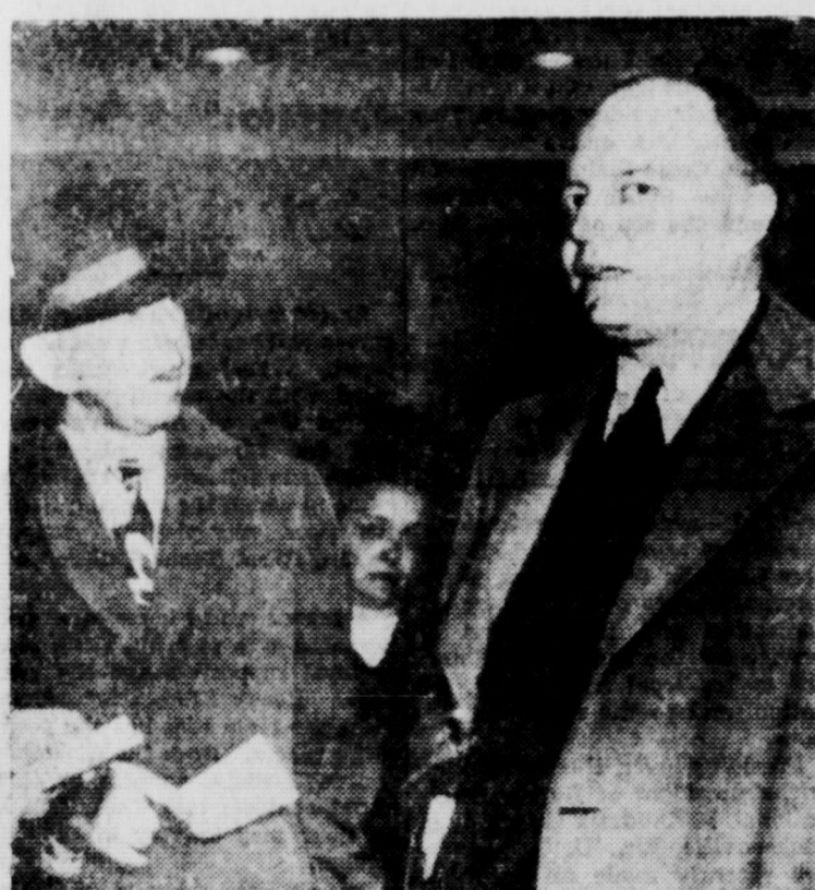
Harold E. Stassen, right, candidate for the Republican nomination for president, had a fast interview with a reporter in Portland, on arrival for another speaking tour. Arrangements had been made for a debate in Oregon between him and Governor Thomas E. Dewey of New York.