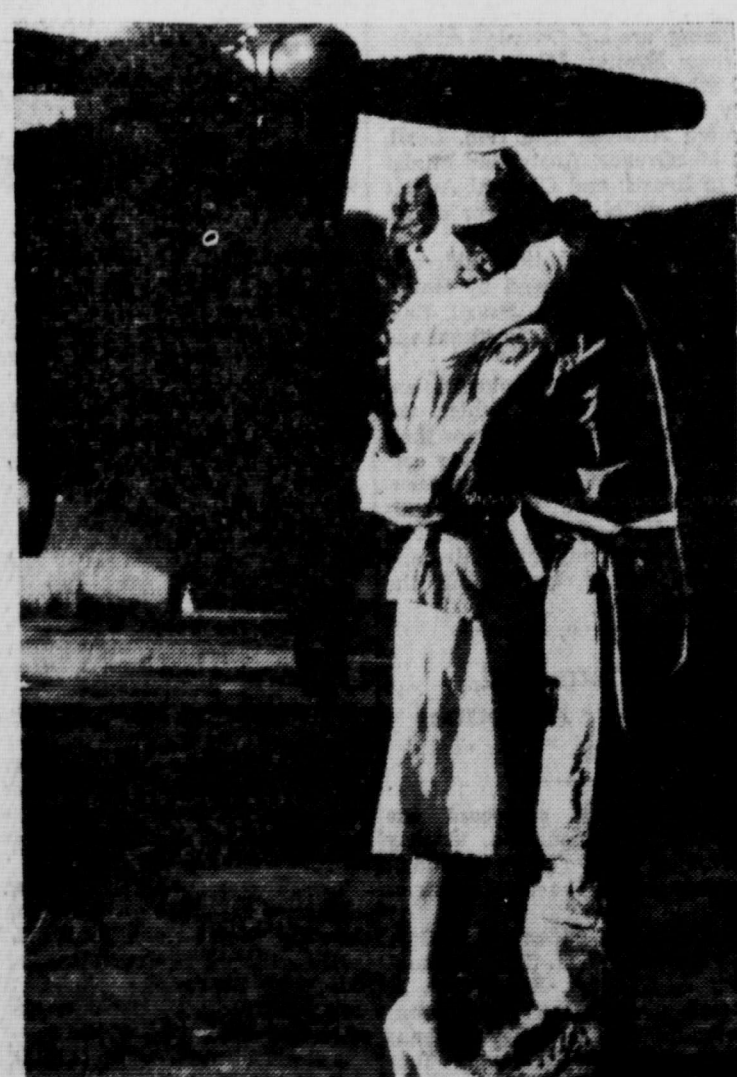
A crewman received a fond goodbye when three B-29 Superforts left Castle Air Force Base, California for Okinawa via Germany, the Middle East and India. Authorities said the flight was part of a routine program currently being conducted by the Strategic Air Command.