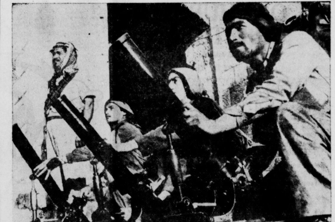
Lebanese soldiers of the Arab Army of Liberation did some last minute training with their French seventy-five MM trench mortars as the British evacuation deadline neared. Meanwhile, the armies of four Arab nations were retreating closing in toward the Palestine frontier before the British surrender their mandate.