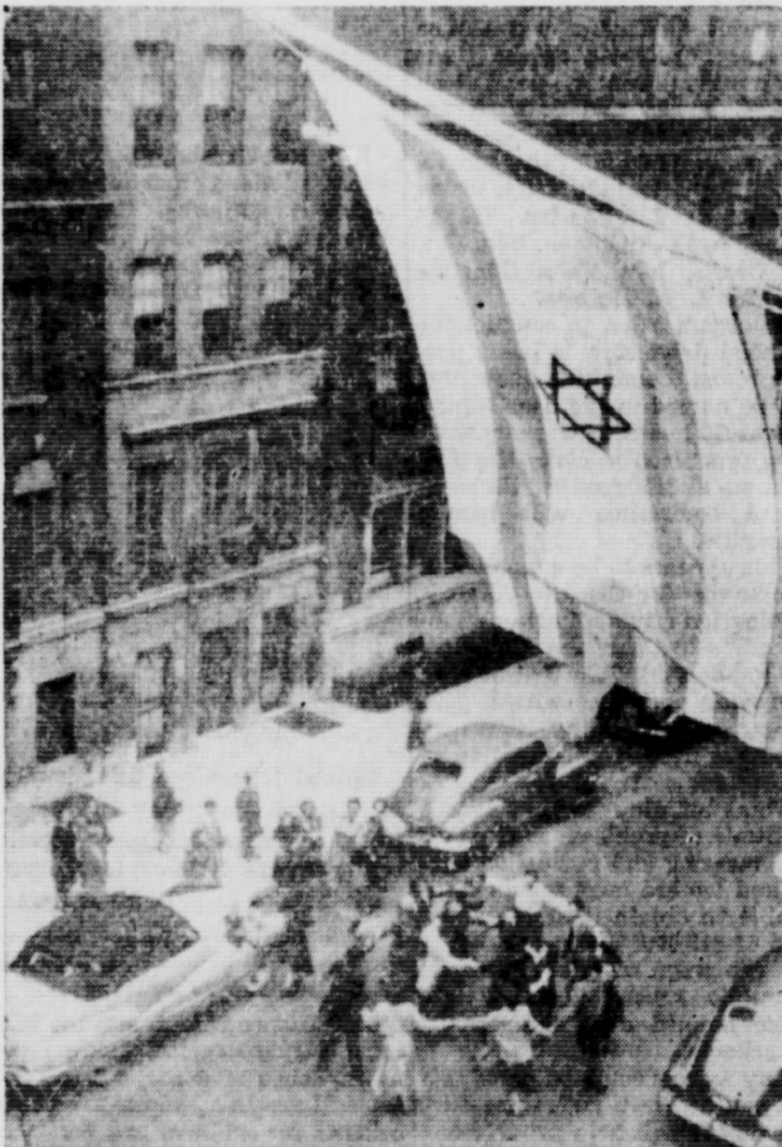
As the newborn state of Israel battle for its infant life against Arab attack, Jews in New York dance in the street to celebrate Israel's creation. The flag of the new nation, a gold Star of David flanked by two blue stripes on a white background, flies alongside the Stars and Stripes from the offices of the Jewish Agency.