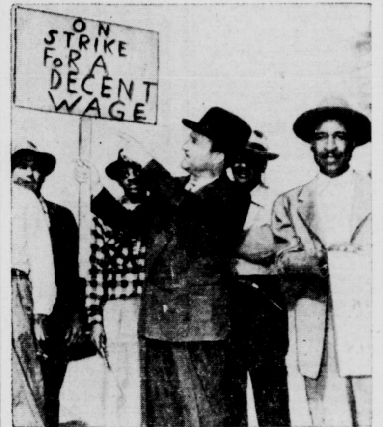
Sen. Glen Taylor, of Idaho, Henry Wallace's Third Party running mate, joins picket at the Kansas City, Kan., Cudahy meat packing plant. Wallace recently visited striking auto workers in Detroit.