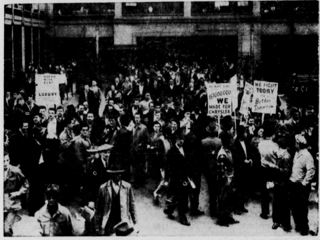
As scheduled, seventy-five thousand Chrysler workers, members of the United Auto Workers (CIO), walked off their jobs in Detroit to strike for higher wages. As workers came from the Dodge main plant they were handed signs and put on the picket lines.

burial of their nephew who was killed in action in 1941.