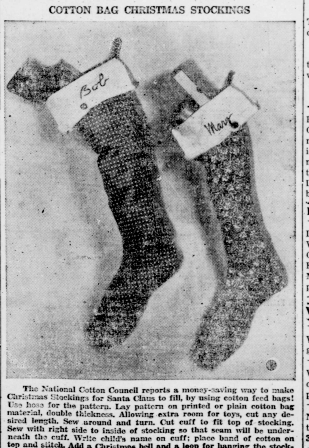
The National Cotton Council reports a money-saving way to make Christmas stockings for Santa Claus to fill, by using cotton feed bags!

Truffles are fungi that grow underground on oak leaves. The Gulf of California is among the finest fishing grounds in the world. Read the Herald Ads and save.