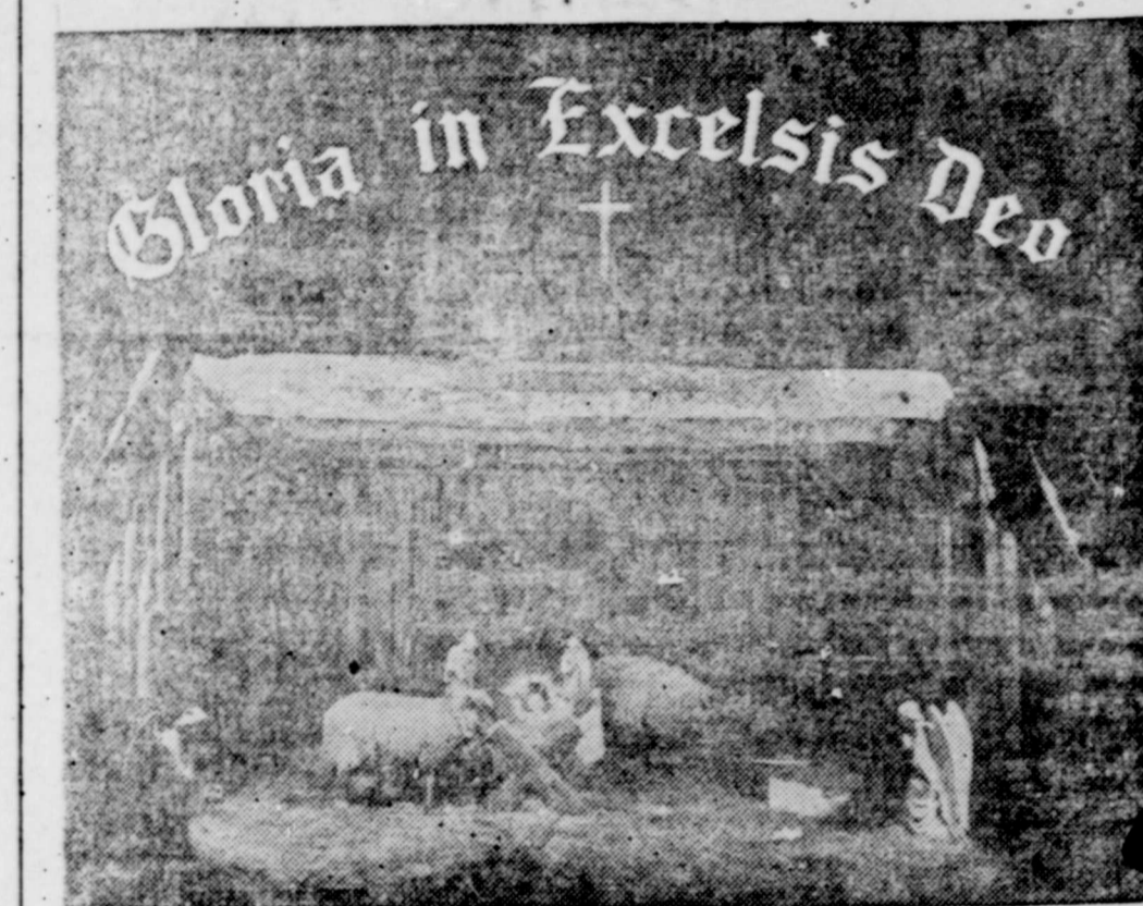
THE STABLE AT BETHLEHEM . . . The Babe in the manger, surrounded by the gentle animals, is a vision we can see more clearly with our hearts than with our eyes. And seeing it, we may truly say, "Glory to God in the highest."

Finally, toys should have what the specialists call a "do-with" quality. Good old stand-bys such as wagons, blocks, clay, sand, finger paints, and the like may fit into the child's interest of the moment.