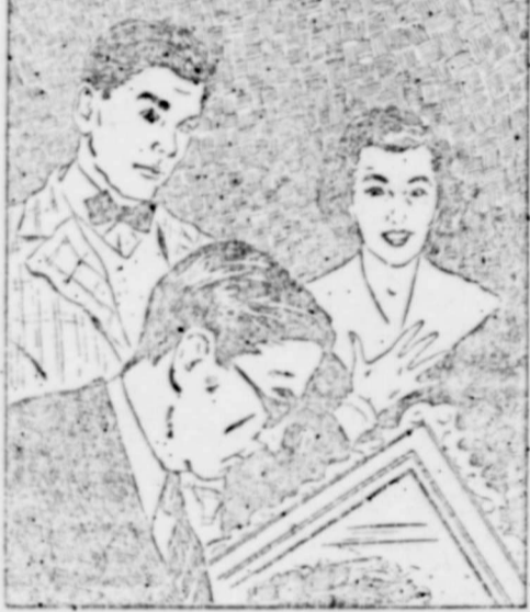
Mrs. Southern held her breath while he tent to study the painting.

in an hour's time," he told his wife a moment later. "We'd better not get too optimistic though. Probably turn out to be worthless."