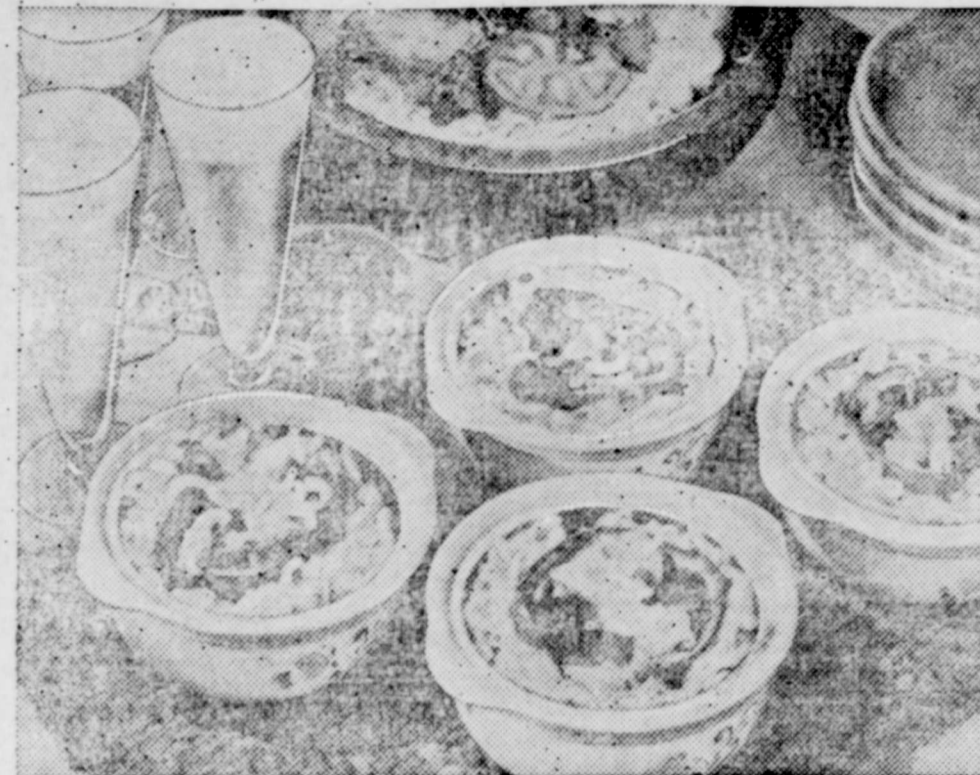
Economy-minded homemakers find baked macaroni casseroles accompanied by raw vegetable salad with glasses of tangy beer easy on the budget.

Delicious macaroni casseroles can be prepared in a jiffy by adding leftover meats or stuffed green pepper halves. Your favorite raw vegetable salad with plenty of zesty dressing, hot crusty rolls, and sparkling beer is a meal with plenty of appetite appeal. A budget-building hearty main dish, macaroni casseroles are a prime favorite with everyone.