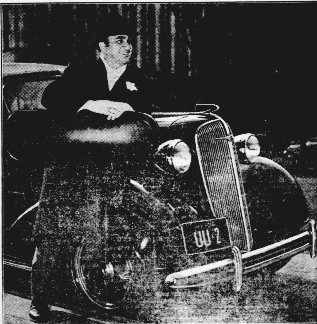
Rubinoff and his violin—and Chevrolet—are a combination that few, if any, radio listeners in the United States have not received in their homes via the air. The famous violinist and his Chevrolet Musical Moments programs, have the distinction of going on the air from more than 100 stations more times than any other program in the history of radio. Three hundred and seventy-eight stations broadcast these times a week, a total of 1134 fifteen-minute programs. That figures out at 263 hours, and if one week's programs were broadcast one after the other, day and night, it would require 11 days. The illustration shows Rubinoff, carrying his precious violin, posing with his car after a special appearance at Detroit.