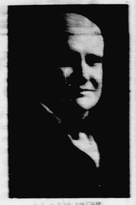
A PLEASURE ASSERT

186 Jame for Bany Coid, listed on East Houston Breet,