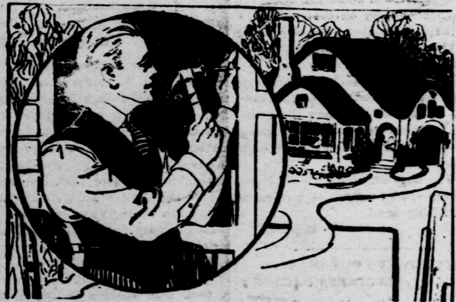
REPAIR TIME MATERIALS

The handy man around the house who's on getting the place fit to withstand winter's...will do well to see us about his needs. We carry all sorts of Building Materials of the Best Quality and at Right Prices!