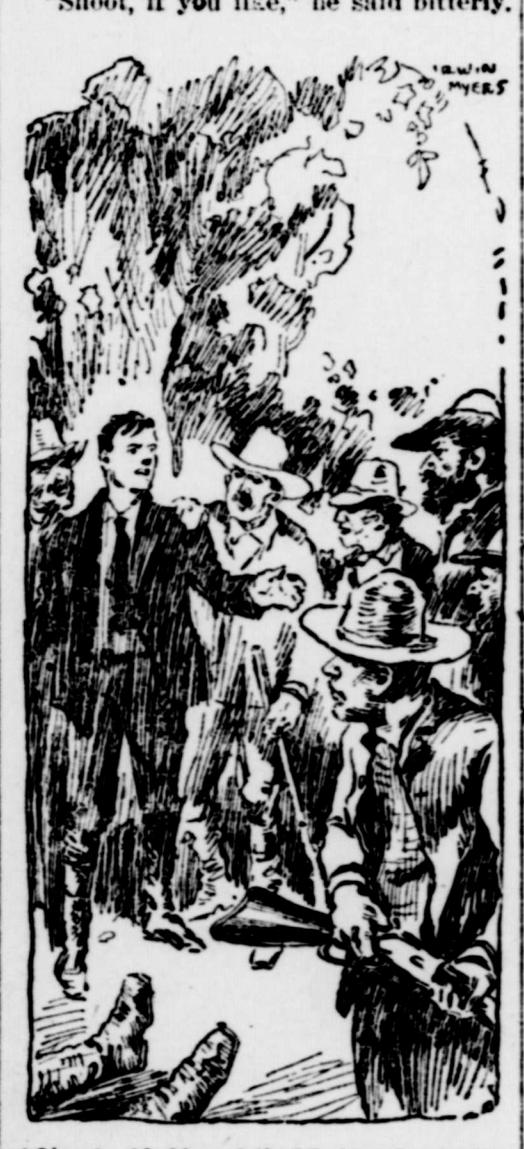
"Shoot, If You Like!" He Said B

Five minutes passed, five minutes that were as five years to this man who had never been in the presence of death before. Then he realized that he was being surrounded by kinsmen of the dead mountaineer. He looked up into their ashen, angry faces, and they cursed him. Big and gripping brown hands were placed upon him; several rifles were turned upon him. He arose and spread out his arms, and offered his breast to the frowning muzzles. They could give him, at least,