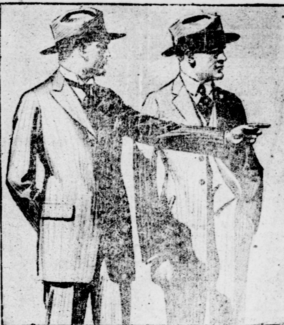
"Tailored to Measure by Born"

How about a new Spring Suit, tailored to measure by BORN? BORN clothes are worn by men who know the value of real Tailored-to-Measure Clothes. Let us take your measure.