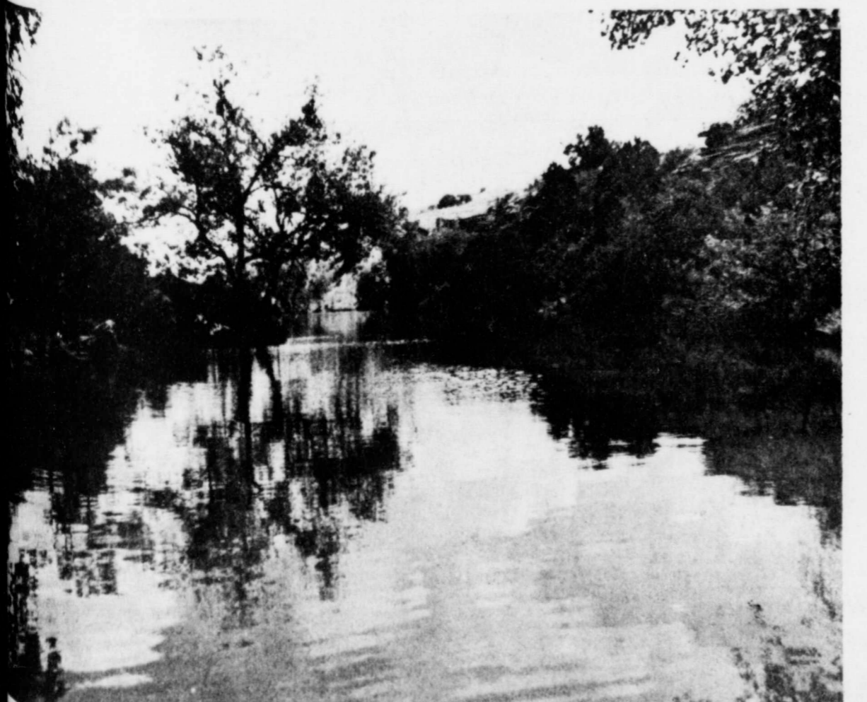
Lake Mackenzie — The most beautiful lake in Texas is now only 45 minutes from Plainview. Tule Lake, which has received about 22 feet of water, has now backed up in the creeks and is one of the most scenic lakes in Texas.