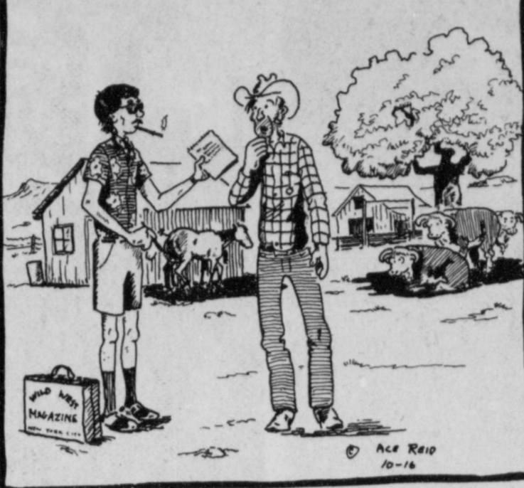
"Yes, Mr. Writer, we still have cattle stampedes... nearly everytime we head 'em toward a feed trough!"