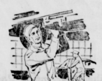
EXCHANGE or REPAIR