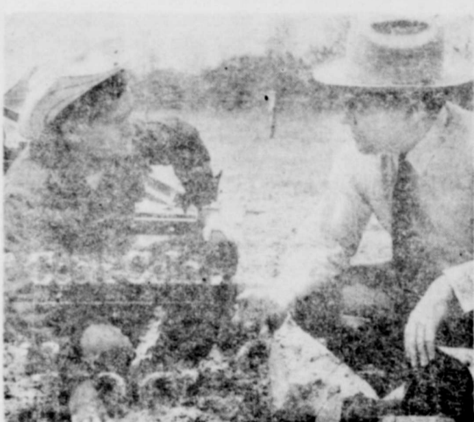
Texas Farmer and Friend

a little harder and my pulse beat a little faster. I can only say to him that the greatness of Texas is not in its size but in its men, and one of the greatest Texans of our times is the Junior Senator from Texas, Ralph Yarborough."