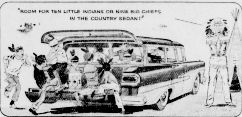
"ROOM FOR TEN LITTLE INDIANS OR NINE BIG CHIEFS IN THE COUNTRY SEDAN!"

Nine fit fine into this handy some 4-door wagon. And its equally big brother, the Country Squire, features mahogany-like side paneling... a Ford styling exclusive.