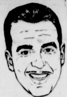
See the Ford Show on NBC-TV