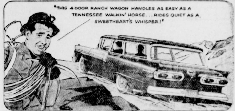
"THIS 4-DOOR RANCH WAGON HANDLES AS EASY AS A TENNESSEE WALKIN' HORSE... RIDES QUIET AS A SWEETHEART'S WHISPER!"

To make an impressive arrival, choose the Del Rio Ranch Wagon. This 2-door wagon has a high-style air that will gather envious glances wherever you drive.