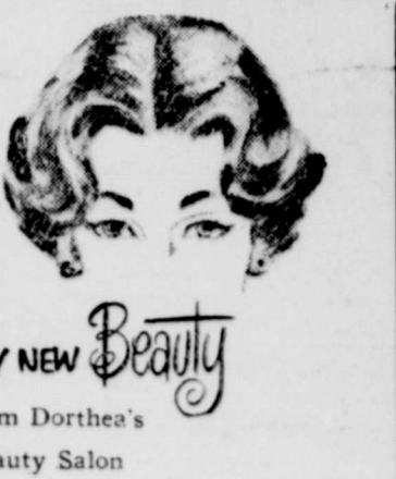
ENJOY NEW Beauty from Dorthea's Beauty Salon

W! something NEW for in Dorthea Weekes Beauty Salon with frances cosmetics