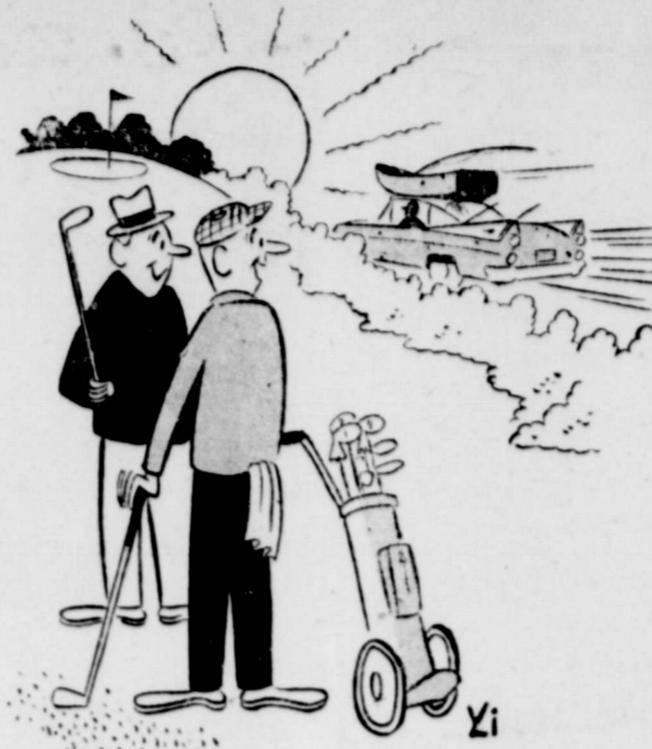
"Can you imagine anybody crazy enough to get up this early in the morning to go fishing?"