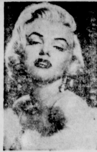
MARILYN MONROE is at her most alluring as the captivating blonde in the CinemaScope musical, "There's No Business Like Show Business," an all star production to show at the Rose Theatre on Sunday and Monday.

The library also has the new 19 volume set of the World Book Encyclopedia.