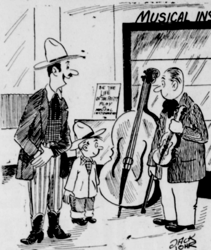
"Take the big one, son, remember you're from Texas"...

OF FAITH IN THE basic honesty of people. Many a man or woman has become innocently involved through ignorance of what is going on, or through pressure applied in one way or another, in some wrong doing. But only a very few, when the facts are demanded will face up and lie—they may hedge on their answers, or refuse to answer because they don't want to hurt a friend; some will even do all they can to prevent talk from getting to the show-