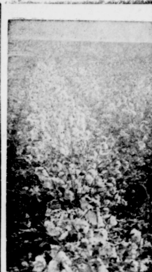
This fine field of Empire cotton made almost 3 bales per acre. Harvest began Sept. 12 and was completed Nov. 3, 1954.