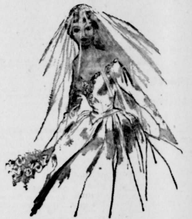
SHOP FOR THE BRIDE MONDAY