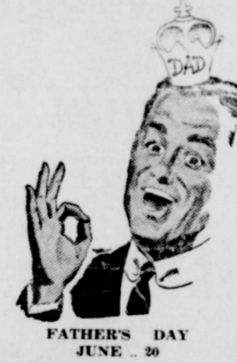
FATHER'S DAY JUNE 20