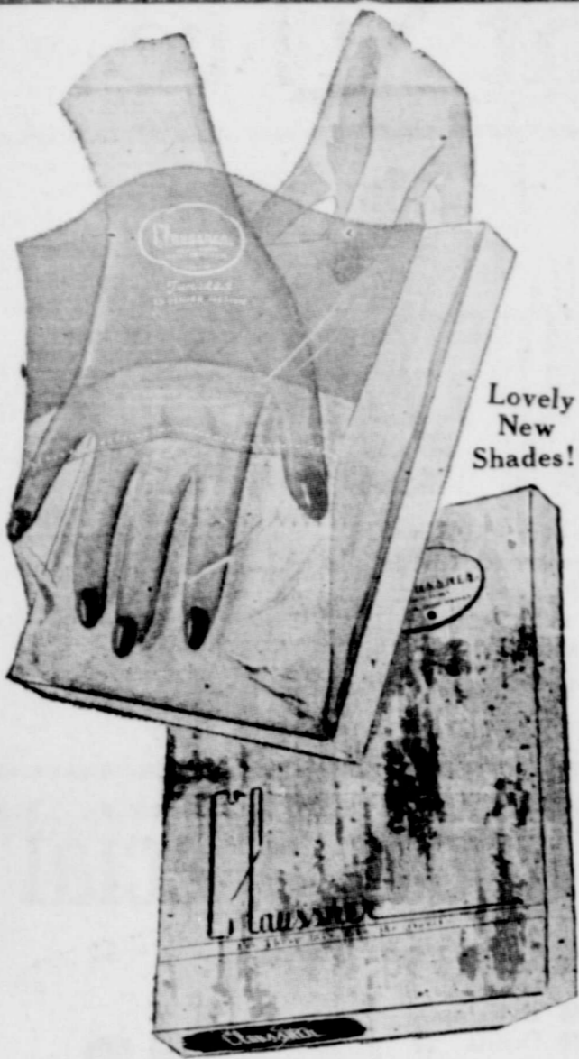
Lovely New Shades!