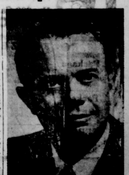
JOHN BEN SHEPPERD

Texas Attorney General John Ben Shepperd formally filed for re-election to a second term recently, subject to action of the Democratic Primary. In his announcement Shepperd pledged continuing war by his office on "crime, Communism and corruption." "We feel our quick action in checking the drive by the Communist Party to take over key Texas ports and our fight in Duval County to uncover and halt the theft of public funds have both won approval of the people." Shepperd, who was elected Attorney General in 1952 after serving two years as Secretary of State, is 38 years old and a native of Gladewater, Texas. In his race for Attorney General two years ago, Shepperd received 80 per cent of the votes. In his home county Gregg and in Travis County where he now lives, he received more votes than had ever been cast for an Attorney General in the history of either county. As yet, he is unopposed for re-election. During his first year in the Attorney General's office, Shepperd led important actions for the state such as defense of the Tidelands Act, made proposals to ease the Texas Drought Areas, and successfully blocked a Communist threat to Texas ports and oil industrial centers.