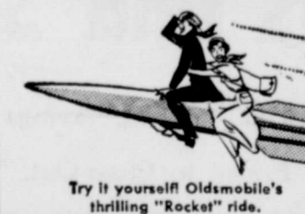
Try it yourself! Oldsmobile's thrilling "Rocket" ride.

Enthusiasm for the "88" rockets to an all-time high! Prices of the "88" hit an all-time low! Now Oldsmobile offers America's most-talked-about car, the Futuramic "88," at lower prices for '50. This is that flashing action star, the lowest-priced "Rocket" Engine car! This is the car with such spirited response that millions have heard about it—tried it—thrilled to its brilliant performance! And this is the car that offers the smooth driving ease of Oldsmobile's new Whirlaway Hydra-Matic Drive*—also at a lower price for 1950! So give us a ring today—make your date with a "Rocket 88"! We'll be happy to show you the unprecedented value of the "88"—and prove our point with a thrilling "Rocket" ride!