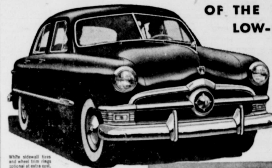
White sidewall tires and wheel trim rings optional at extra cost.

BIG ECONOMY Great gas mileage—proved in the Grand Canyon Economy Run. There a Ford Six with Overdrive won from the three full-size, low-priced cars. And with Ford's low first cost, low operating cost, high resale value, it's the "Big Economy Package" of its field. BIG POWER—V-8 or "6" Your choice of two great economy engines, the famous 100-h.p. V-8—the only V-8 in its field—or its companion-in-quality, the 95-h.p. Six. BIG SOFA-WIDE SEATS Soft, wide seats with the most hip and shoulder room in the low-price field. Seats that are "comfort contoured" for the utmost in big car luxury.