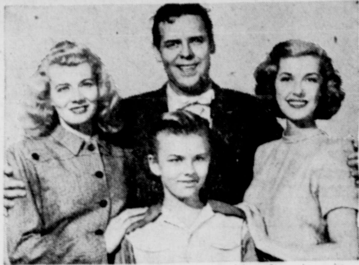
Fenny Singleton, Arthur Lake, Anita Louise and Larry Simms in a quiet moment from "Blondie's Big Moment," a Columbia Picture