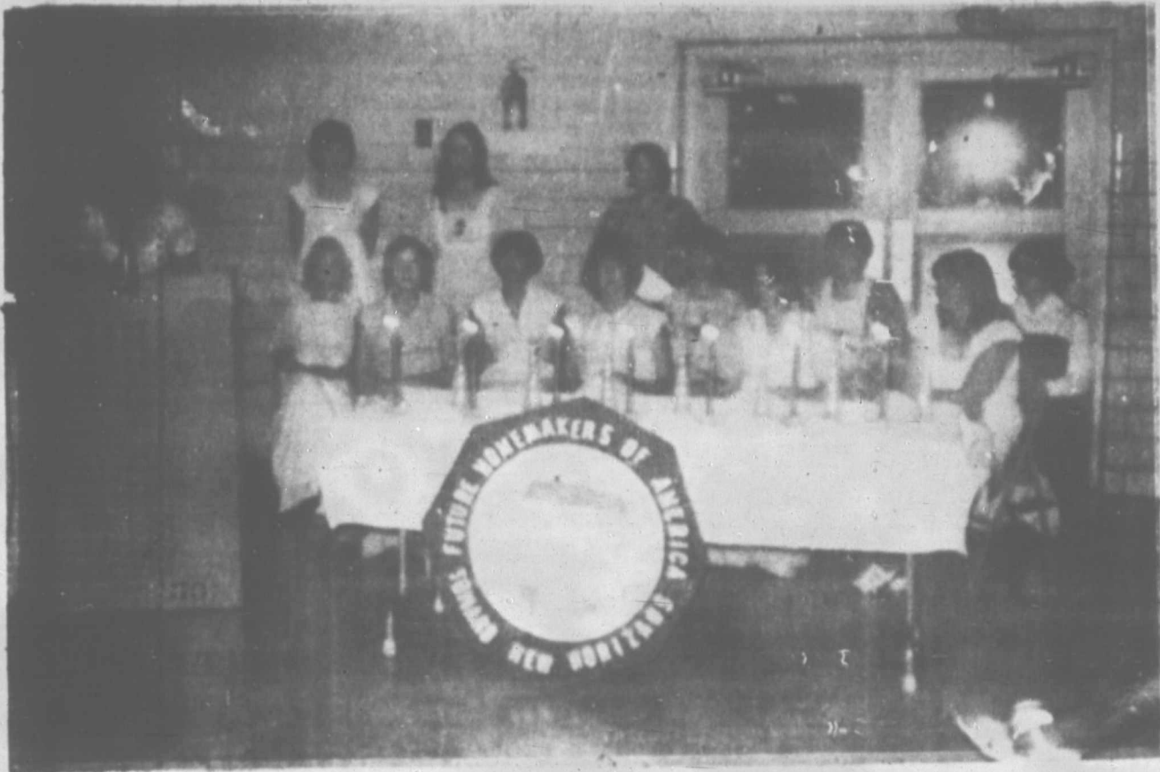
ABOVE IS PICTURED the officers of Sudan FHA during installation Monday night at the style show.