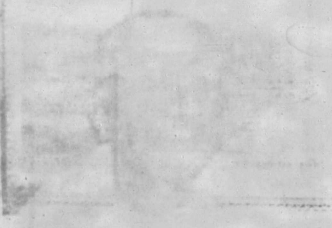
MISS LAMB COUNTY PAGEANT, 1977, is shown in the photograph.

Miss Lamb County Pageant, 1977, is shown in the photograph.