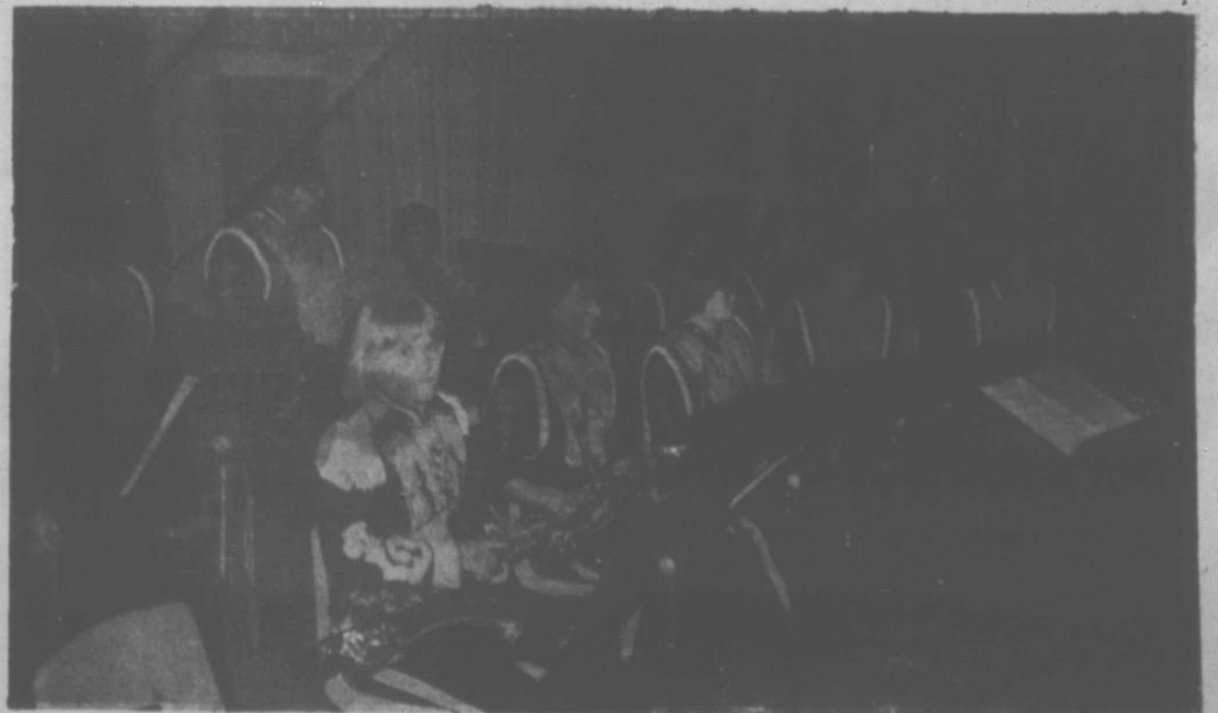
ABOVE IS THE Sudan Stage Band, at the "Spring Sting" last Tuesday.