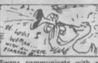
Swans communicate with a loud, trumpet-like sound.

The afternoon evening meet, which almost always seems to attract pleasant weather, starts at 1:30 p.m. with the finals slated for 5:15 and the mile relay carded for 8:10. Admission is $2 for adults and $1.50 for students.