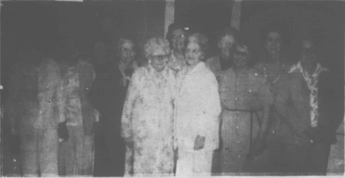
ABOVE ARE PICTURED the "Grandmothers" who were present Monday night at the FHA Style Show.