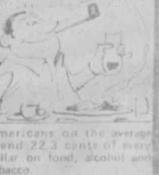
Americans on the average spend 22.3 cents of every dollar on food, alcohol and tobacco.