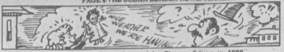
The first talking doll was invented by Thomas Edison in 1888.

503 E. Fifth LITTLEFIELD, TEXAS 385-5121 503 E. Fifth AMHERST, TEXAS 246-3351