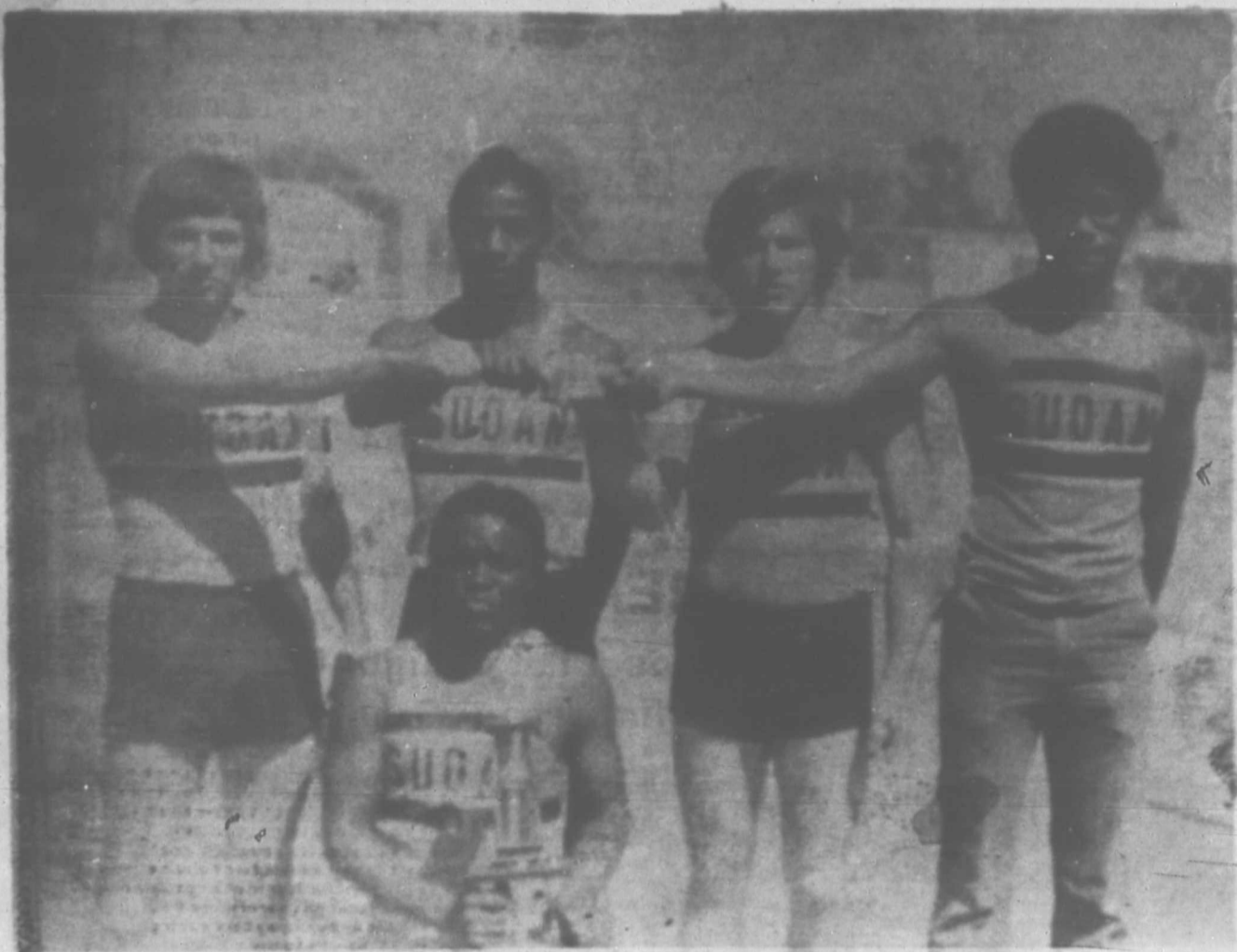
PRINT RELAY WINS DISTRICT -Sudan's Sprint relay won first place in District last week and will be