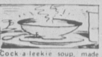
Cock-a-leekie soup, made with leek, is the Scottish national soup.

GARAGE SALE: Black and white TV, stereo, and radio console, small portable black and white TV, Bar stereo, radio, tape player, Baby stroller, table lamps, clothes, mattress, and springs, misc. 608 Hay Street.