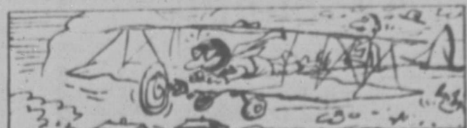
The first airline to establish passenger service was the St. Petersburg-Tampa Airboat Line of St. Petersburg, Florida. It carried passengers 20 miles across Tampa Bay for $5 in 1911.