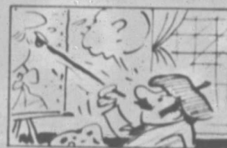
Richard Gibson, an English portrait painter, was reported to be 3 feet 10 inches tall.