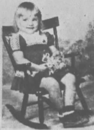
Above are more pictures of children who were in the children's photo contest by Valda of Dionne Studios.