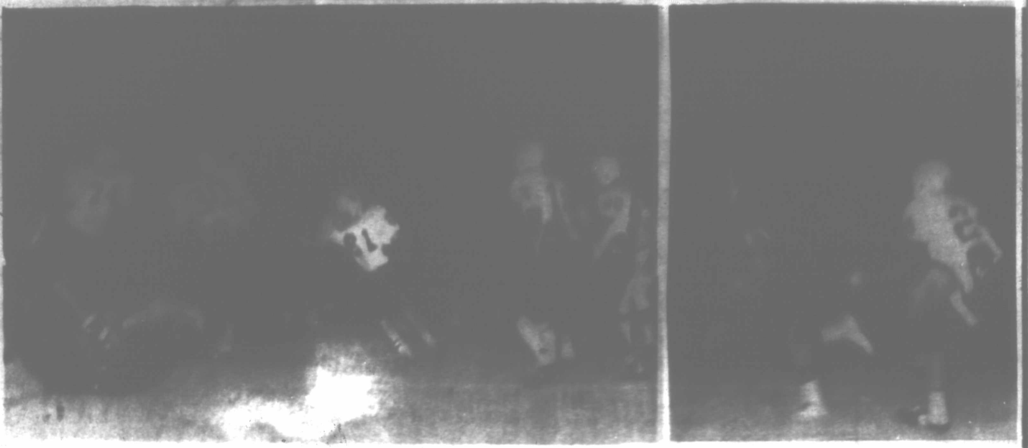
ACTION SCENES TAKEN DURING THE GAME FRIDAY NIGHT WHEN SUDAN WON AGAINST THE MATADORS, 19-0