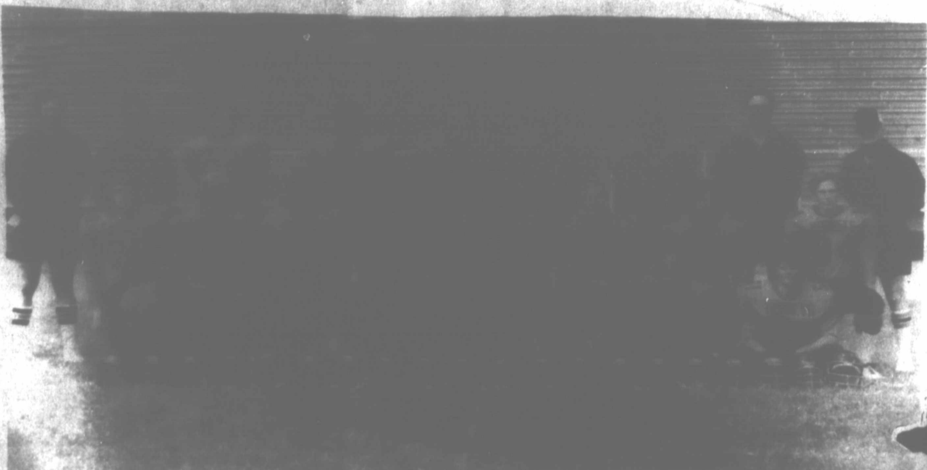
THE SUDAN HORNETS VARSITY FOOTBALL TEAM