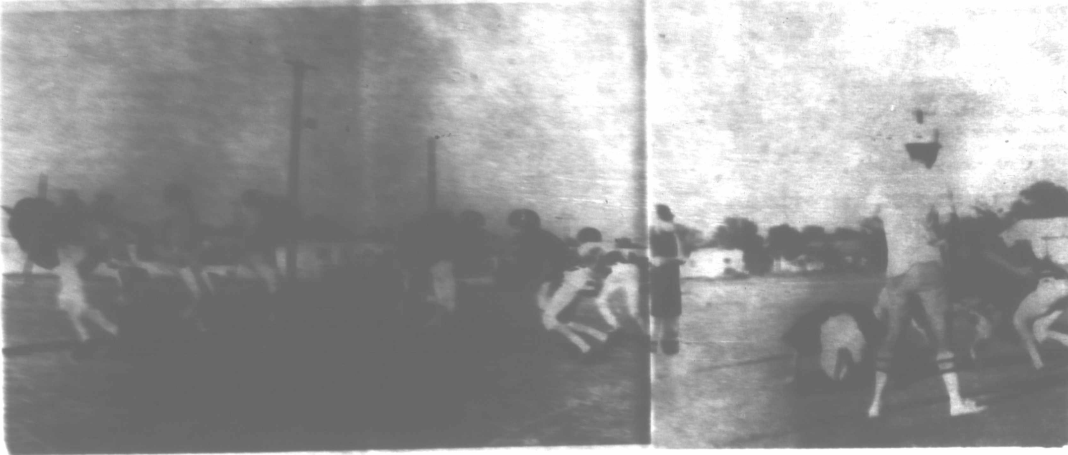
ACTION SCENE DURING WORKOUTS—Above is pictured some of the Hornets as they scrimmage