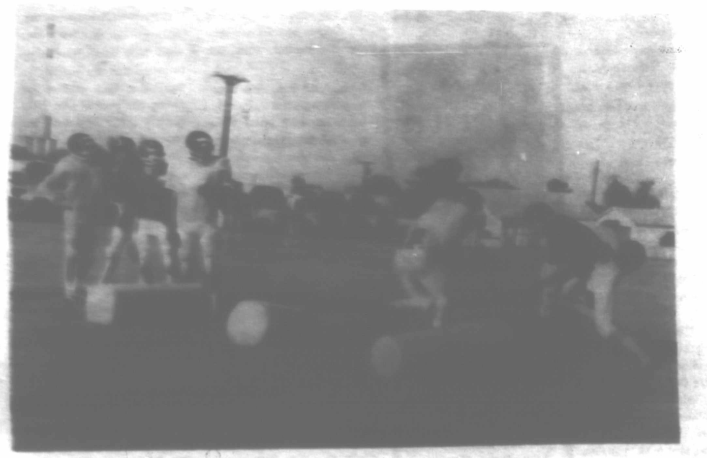
MOVING ACTION Scene of the Hornets during work-outs