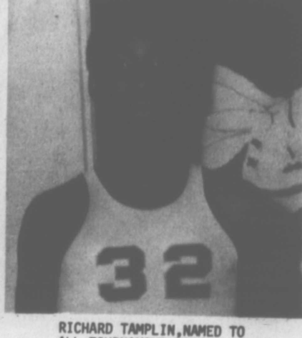
ALL TOURNAMENT TEAM

ding cake, mints, punch and coffee. The couple will make their home in Carlisle, near Lub-