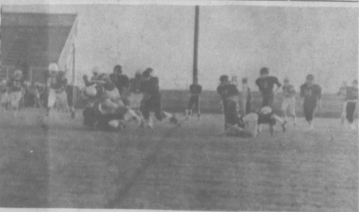
ABOVE IS AN ACTION Scene of the Seventh grade team as they met the Farwell Steers in the Hornet Stadium here last Thursday night when they lost to the Steers, 14-6.