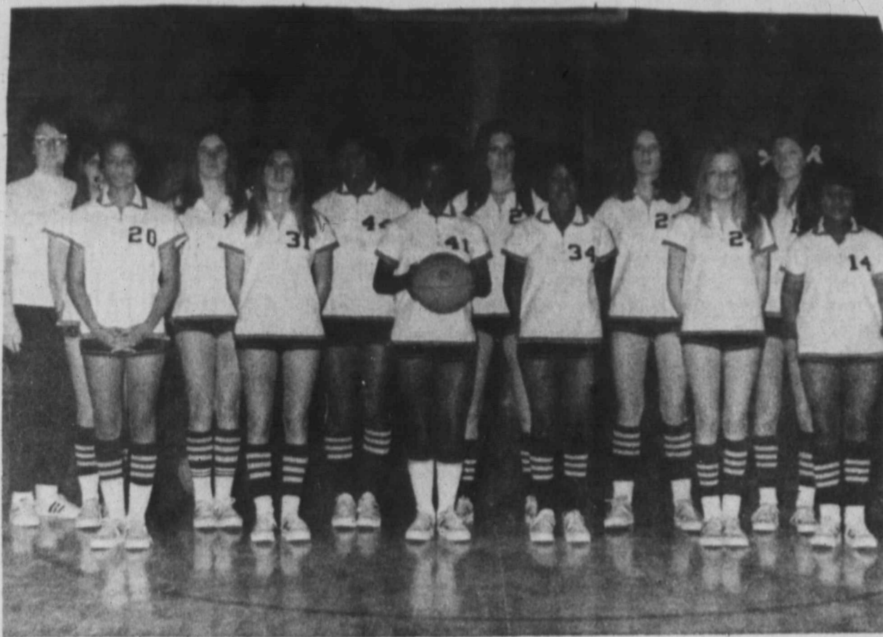
SHOWN above is the 1972-73 Girls "B" Team who won second place in the Amherst Tournament last weekend.