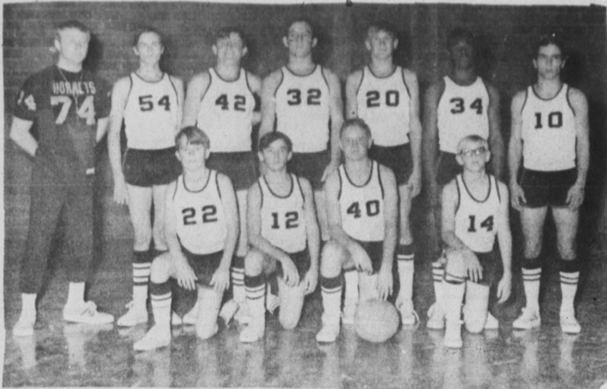
Above is the 1972-73 Boys "B" Team who won consolation trophy in the Amherst tournament last weekend.