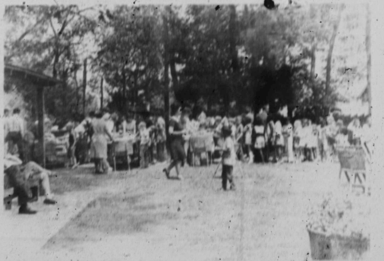
PICTURED ABOVE are some of the approximately 200 guests at the LOTWS cook-out held Saturday in Joe Salems back yard. Sixteen cities were represented. We want to thank each one for being

Seven members of Brownie Troop 7 went on a "Bike Hike" Tuesday when the group rode approximately 7 1/2 miles. En route, they had nature studies, a picnic lunch, and completed steps for the Bicycle Badge. (Continued inside)