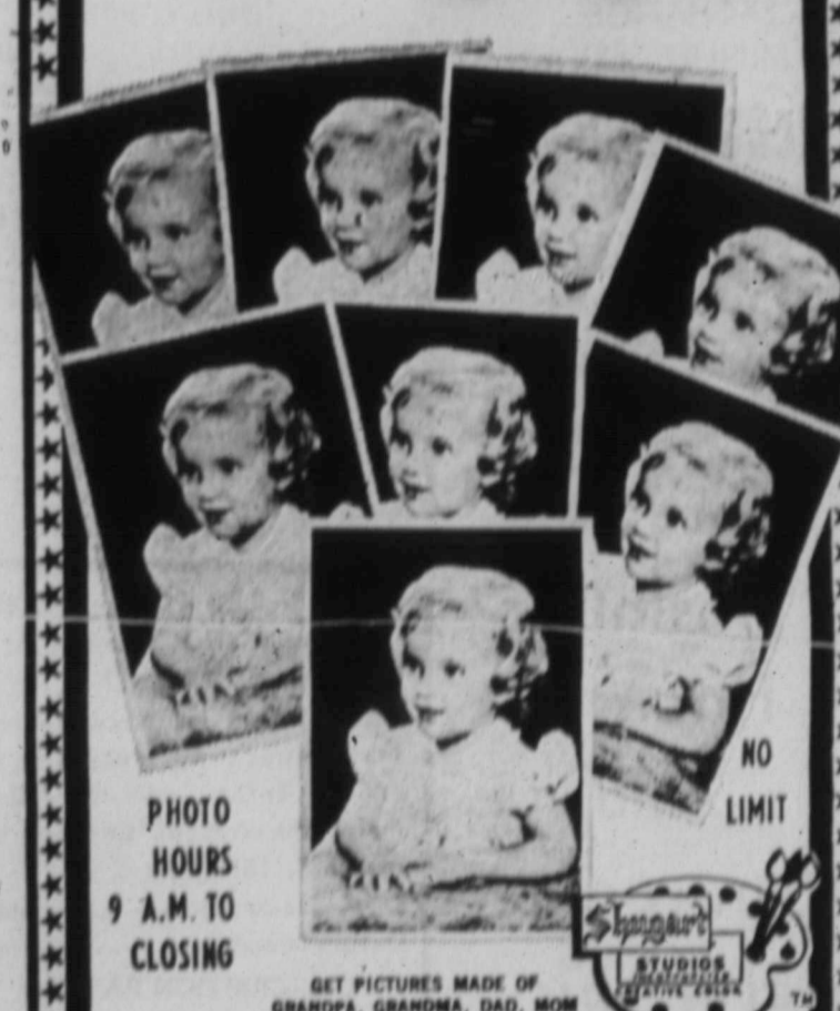
PHOTO HOURS 9 A.M. TO CLOSING

FREE SPECIAL BONUS THIS TIME ONLY 25 STAMP SIZE PHOTOS WITH PURCHASE OF OUR REGULAR SPECIAL 8 KING SIZE WALLET TOTAL OF 33 PHOTOS FOR 99c