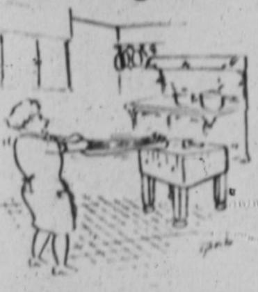
"Stretch the roast, company's coming," she says.