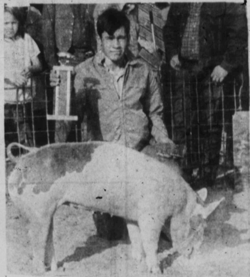
GRAND CHAMPION SWINE