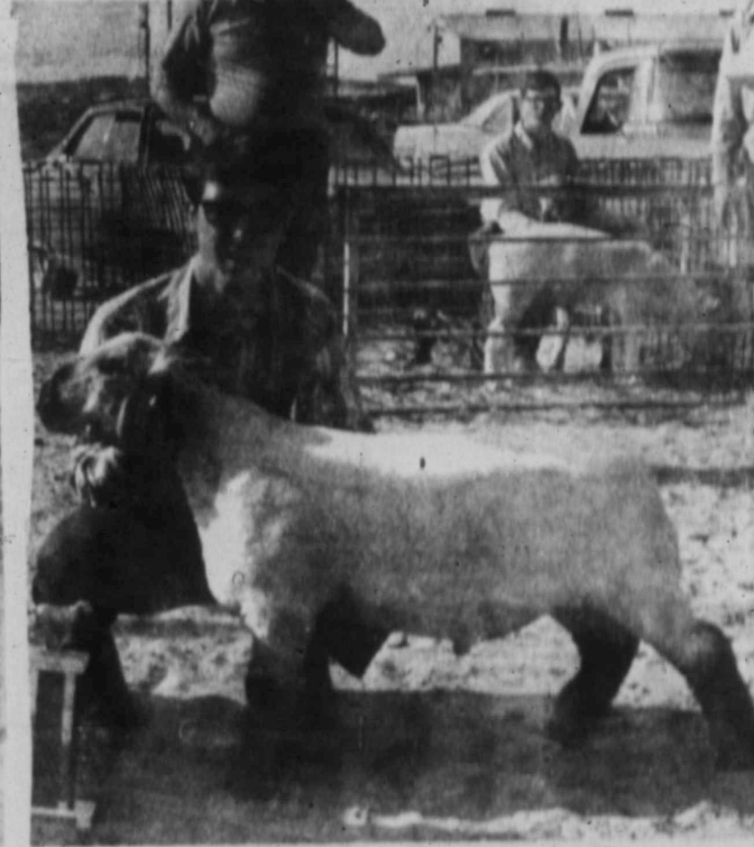
GRAND CHAMPION LAMB