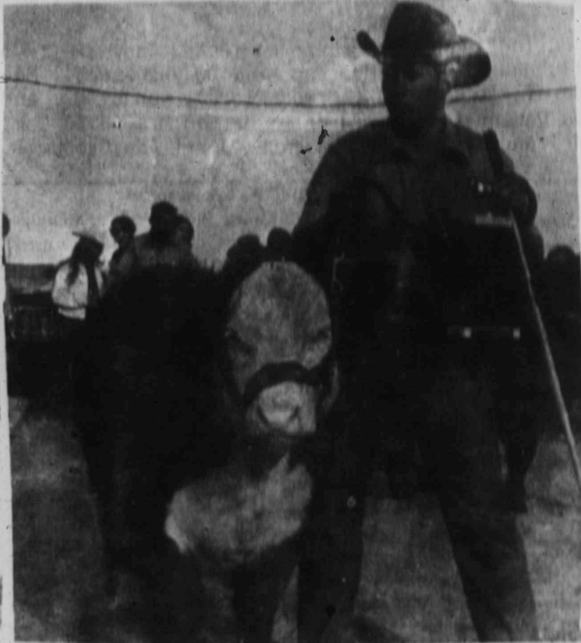
GRAND CHAMPION STEER