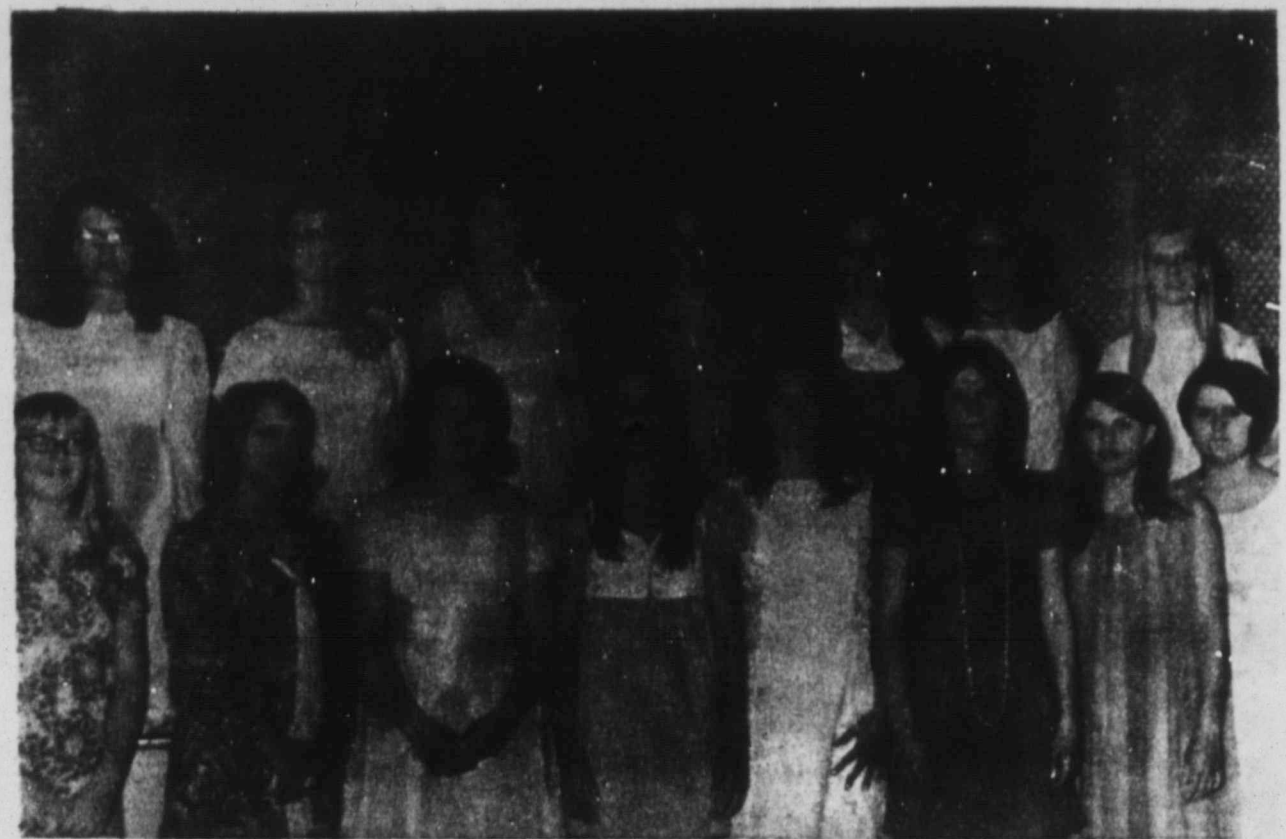
FHA OFFICERS - Shown above are the incoming and outgoing officers of the Sudan FHA chapter taken at the installation Monday night.