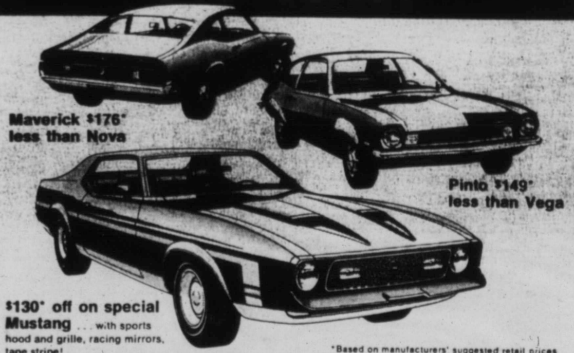
Maverick $176* less than Nova