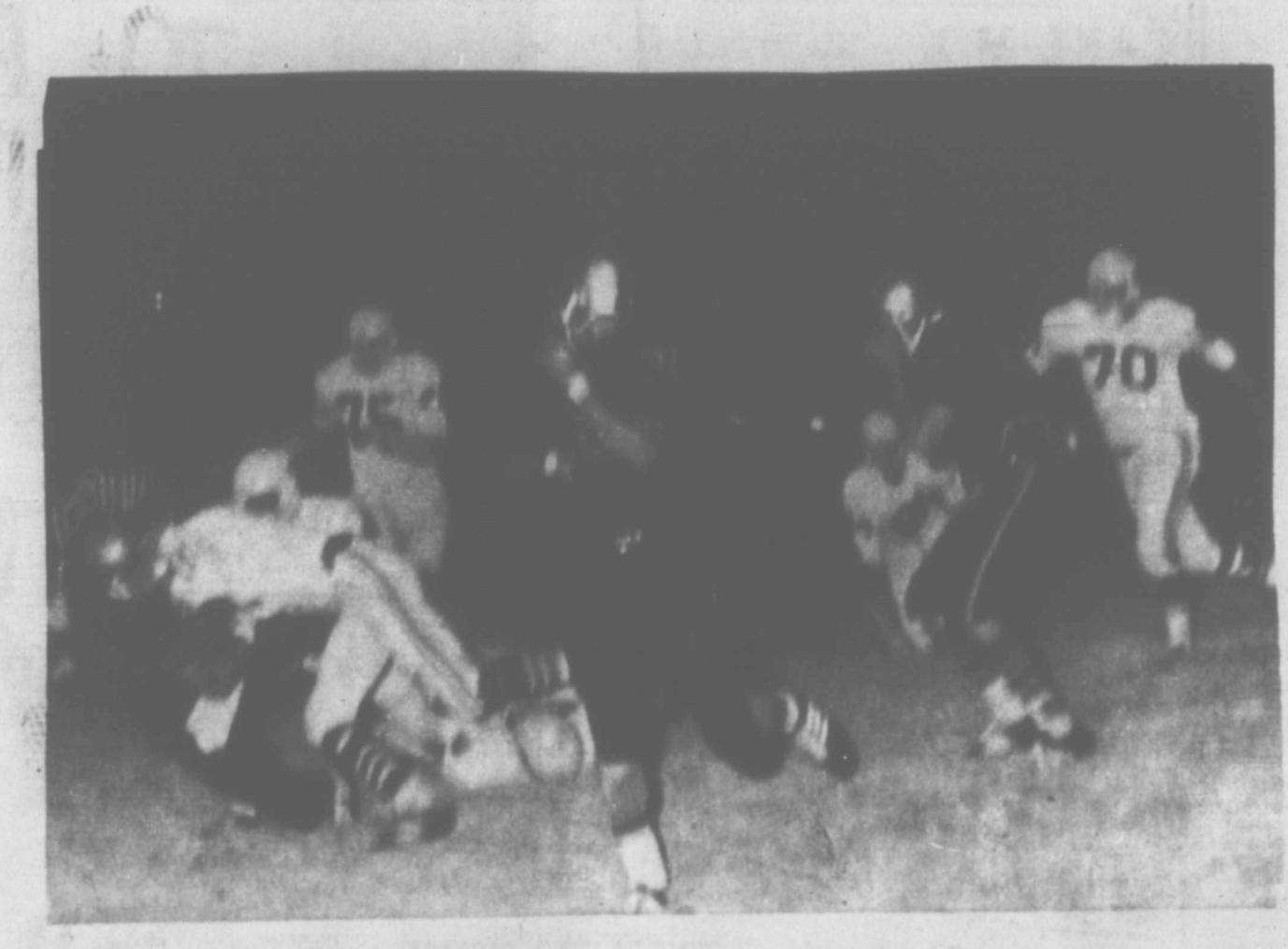
MUSTANGS HIT HARD - Several of the Bovina Mustangs ganged-up to down a member of the swarming Hornets at Bovina Friday night. Back the Hornets to topple the Steers here tomorrow night.