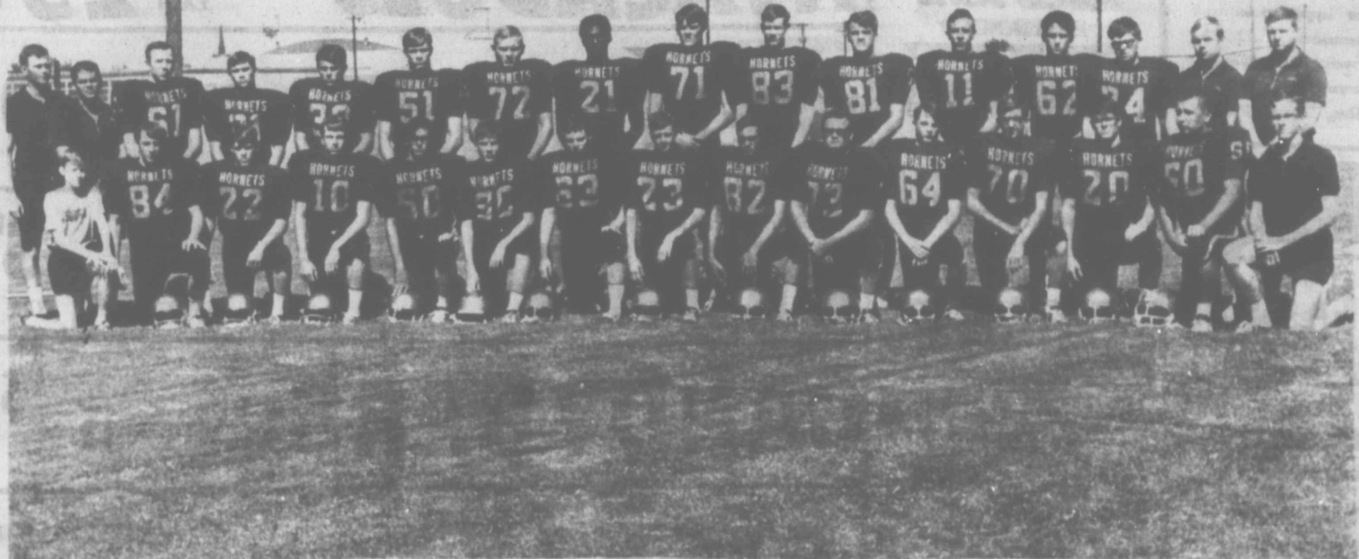
1970 SUDAN HORNETS