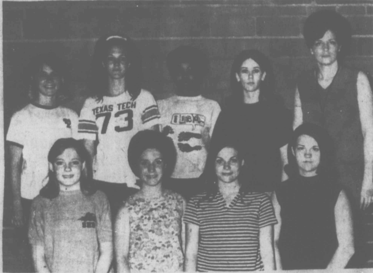
1970 DISTRICT 3-A VOLLEYBALL CHAMPIONS