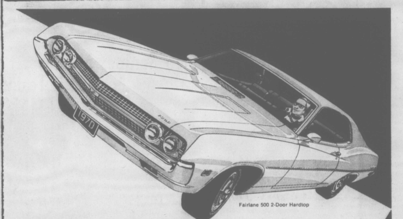
Fairlane 500 2-Door Hardtop