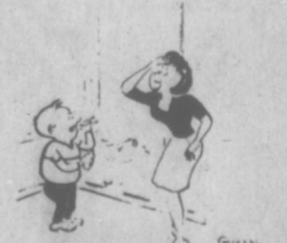
"You're brushing your teeth without being asked. Another giant step forward for Man...!"

The next playday will be held Feb. 15 with the entry fee set at 50¢ per event. No admission is charged for the spectators.