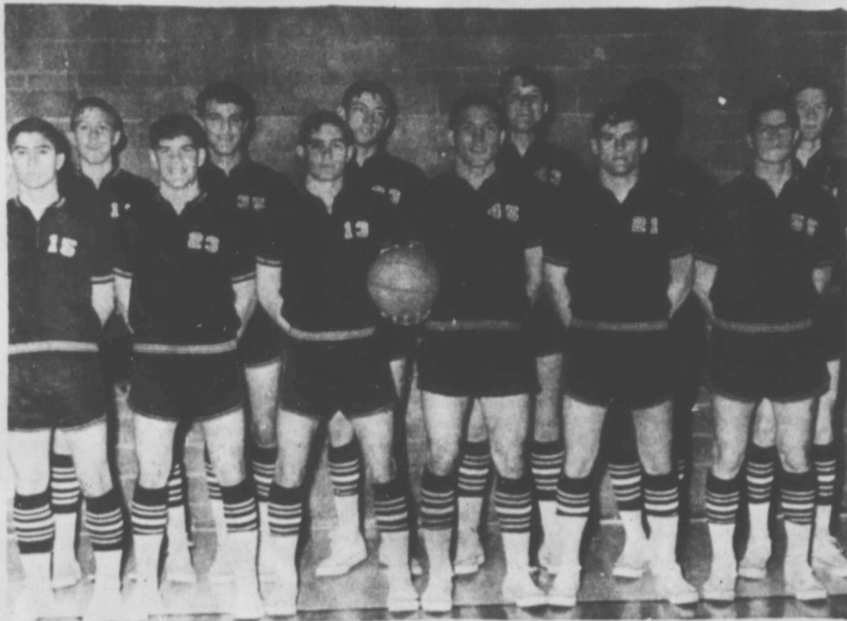
1969 SUDAN BOYS VARSITY BASKETBALL TEAM