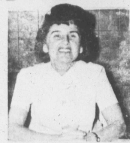
By HAZEL HOUSE

Scripture: II Peter 1:5-11; Philippians 3:13, 14.