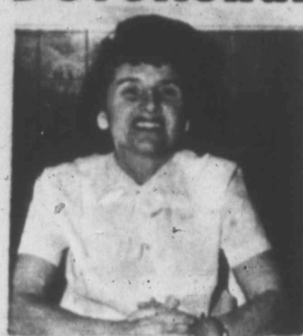
By HAZEL HOUSE

Scripture: Genesis 3:21; 1 Samuel 18: 1-4.